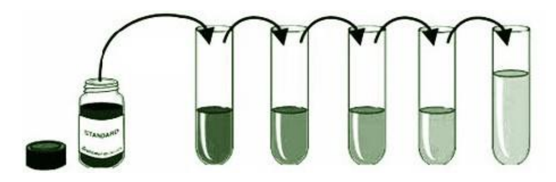
54pmol/ml 36pmol/ml 24pmol/ml 12 pmol/ml 6 pmol/ml 3pmol/ml